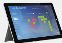
Easy Monitoring Solution