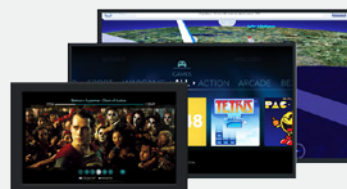
Full HD and Ultra HD Smart Screens