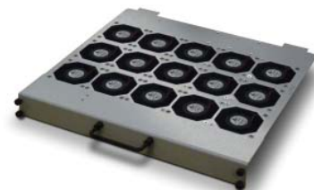
1263HPf fan assembly