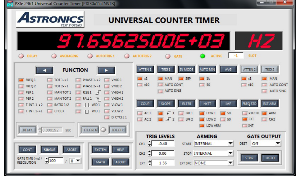
Figure 1: PXIe-2461 Soft Front Panel. Full Control Visible with no Drop-Down Menus Required

Programmable measurement Timeout enables system performance to be optimized where input signals are missing.