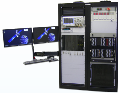
Industrial - Factory Integrated Automatic Test System