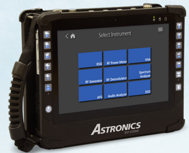
CTS-6000 Portable Test Platform