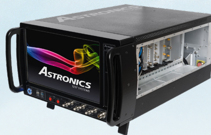
ATS-3100 PXI Integration Platform