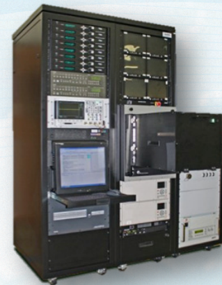
Aerospace – Avionics Automated Test System

Astronics Test Systems helps you solve your toughest test challenges with a host of integrated test solutions for any high reliability application. With nearly 60 years of experience, we offer you customized solutions from a broad base of technologies and systems components to deliver your solution quickly, to your exact specifications, at any location worldwide.