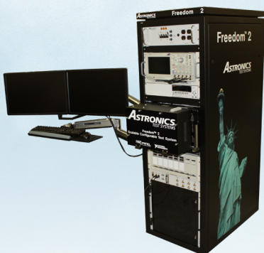
Freedom™ 2 - Universal Functional Tester

Product platforms that can be customized for your program quickly and easily.