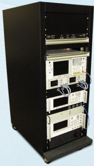
Space - In-Orbit Satellite Payload Tester