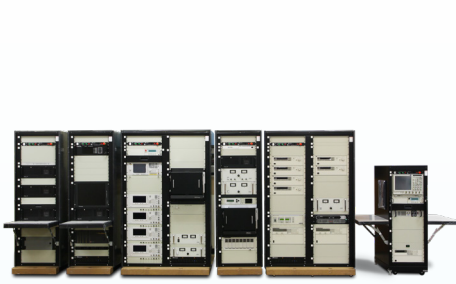
Military - Fully Configurable Missile Test System

Examples of a few custom solutions we've provided over the years.