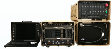
Military - VIPER/T Rugged, Portable Automated Test System