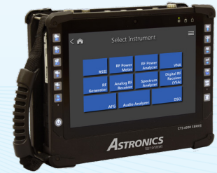
Military - CTS-6010 Portable, Hand-Held Radio Tester