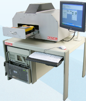
Medical - Portable Defibrillator Test System