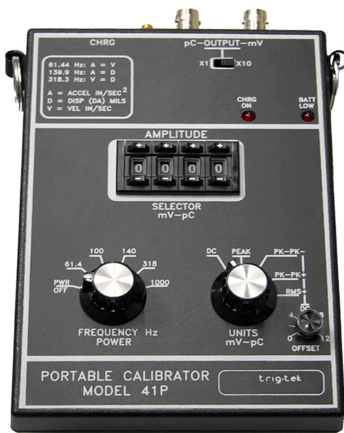
Figure 1-1, 41P Portable Calibrator

The Trig-Tek 41P Portable Calibrator is a hand held signal generator with accurate frequency and level of mV and pC (millivolts and picocoulomb outputs). Primarily used in Environmental Test Laboratories and Engine Test cells, the 41P is ideal as a sensor simulator for remote calibration of monitoring instrumentation.